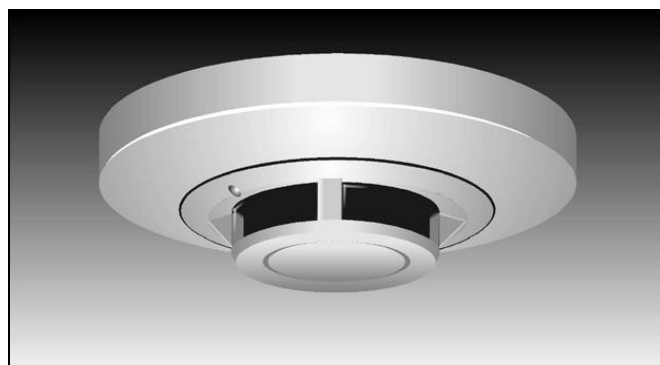
Fig 1: Low Profile Smoke Sensor

The TC806E Photoelectric Smoke Sensor and the TC807E Ionization Smoke Sensor are also available as low profile options.